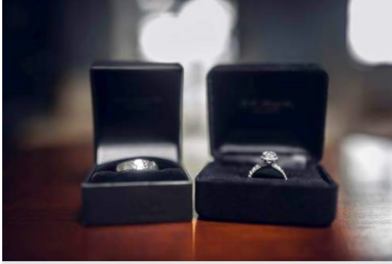
The wedding rings