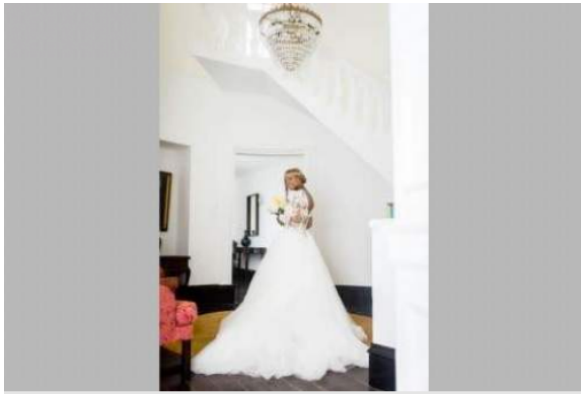
The lovely bride