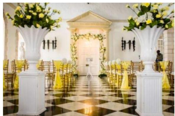
The wedding ceremony setting inside the Trident Castle interpreted by Petals & Promises.