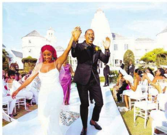
The elated newly-weds make their exit cheered on by friends and family.

"We are overwhelmed with happiness and gratitude to be starting this new chapter of our lives together," the newly-weds shared in a joint statement. "We are excited about the endless possibilities that the future holds for us as a couple and as artists. We look forward to creating even more beautiful art and stories together."